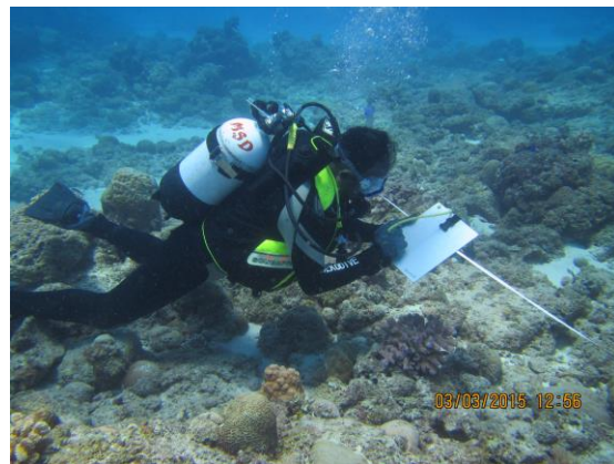
Figure 3 & 4: Long term Coral Reef Monitoring