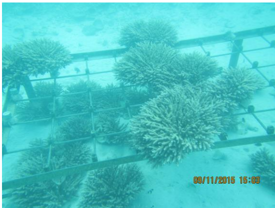
Figure 1: Coral Nursery